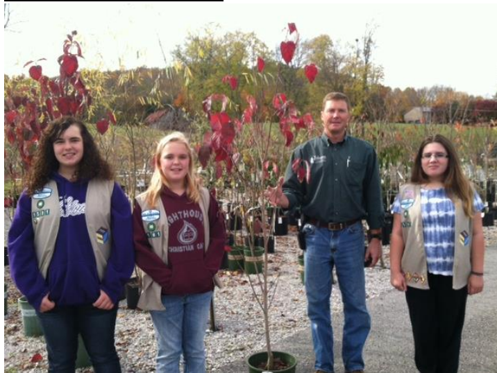
Girl Scouts purchased a tree from Johnson’s nursery and they have planted it in the AGAPE playground