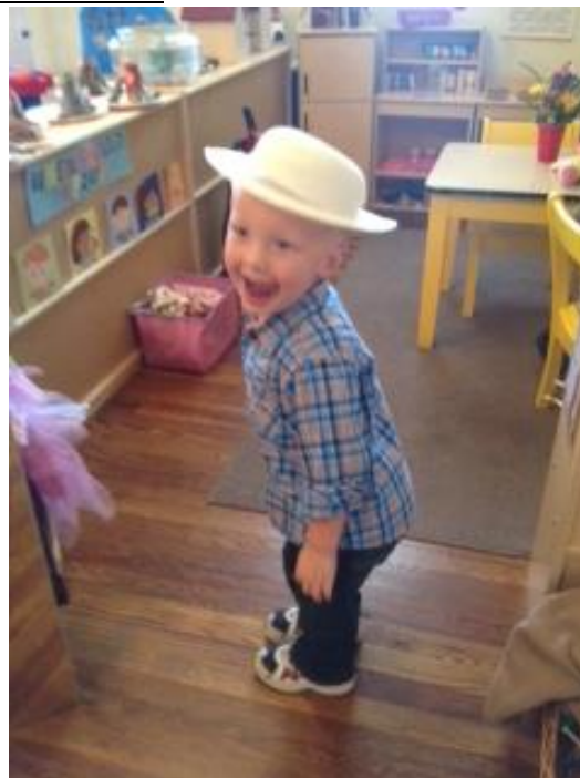
FUN PLAYING IN THE PRESCHOOL KITCHEN