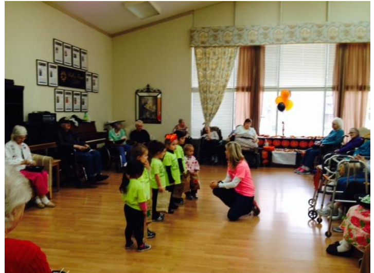
AGAPE STUDENTS VISIT STANDING STONE RESIDENTS