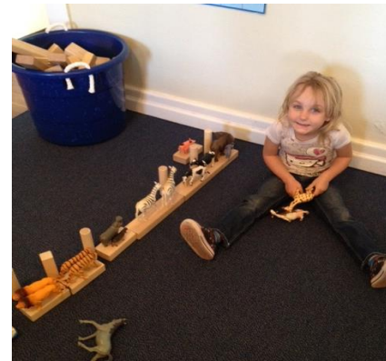
IMAGINATION CAN TAKE YOU ANYWHERE!