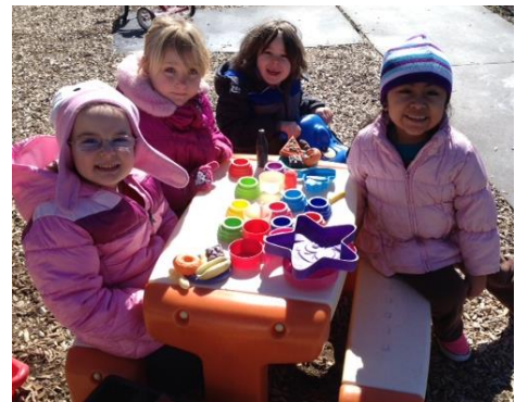
ENJOYING THE LAST FEW DAYS OF WINTER WITH SOME GOOD FRIENDS