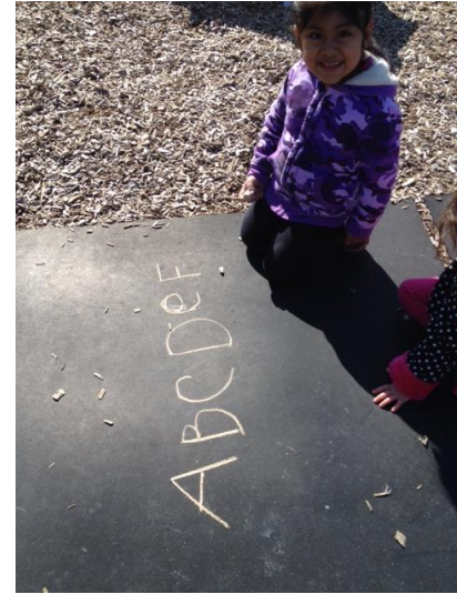
BENEFITS OF BEING AN AGAPE PRESCHOOL STUDENT!!!

1. Our most important resource is God. Please pray daily for our students, their families, our teachers and staff, and the continuance of our program.