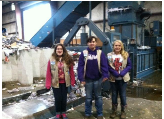
GIRL SCOUTS VISIT THE SOLID WASTE DEPT. IN COOKEVILLE TO LEARN ABOUT RECYCLING SERVICES IN THE AREA.