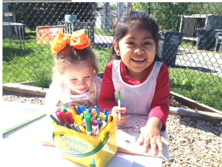
AGAPE STUDENTS ARE ENJOYING THE SPRINGTIME WEATHER OUTSIDE