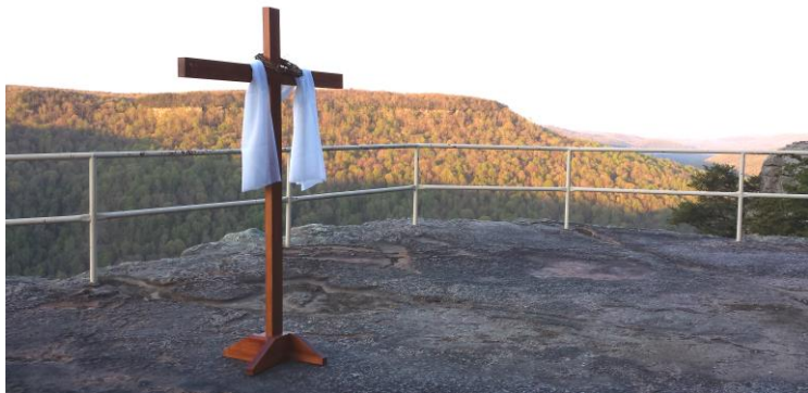
WE ENJOYED A BEAUTIFUL EASTER SUNRISE SERVICE. WHAT A BLESSING FOR PASTOR TOM'S FIRST SUNRISE SERVICE AT EAGLES FLIGHT PARK.