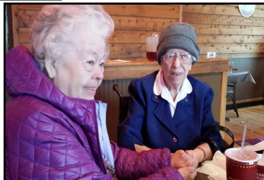
KEEPING EACH OTHERS HANDS WARM....