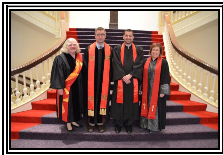
CONGRATULATIONS TO ALL WHO HAVE CHOSEN A LIFE OF MINISTRY