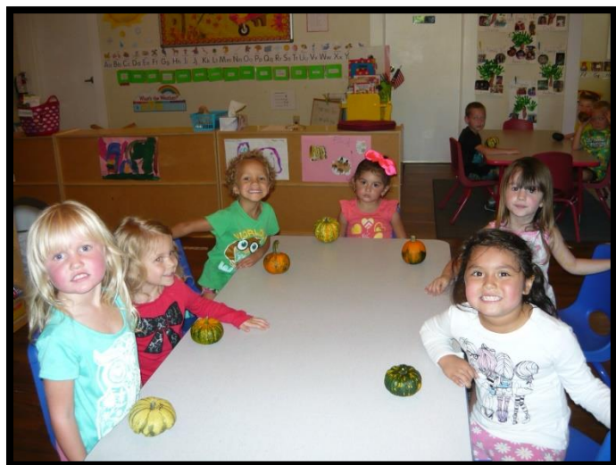
AGAPE STUDENTS CELEBRATE THE FALL SEASON