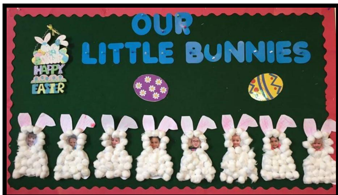
AGAPE STUDENTS CELEBRATE THE EASTER SEASON